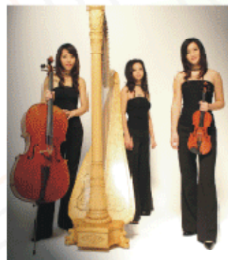
The I-Sis Trio, Singapore

Proceeds from all three concerts go towards the Thai Red Cross Society and the Fund for the Promotion of Classical Music under royal patronage of HRH Princess Galyani Vadhana, Kromluang Naradhiwas Rajanagrindra